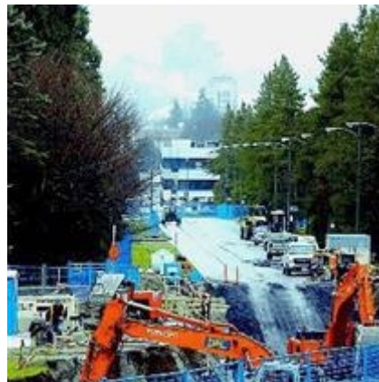
B.C. is building in the rain as workers dig into the Cambie Street portion of the new rapid-transit line to Richmond.